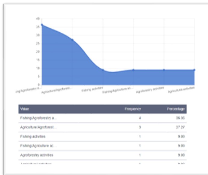
Main Food Production Activities